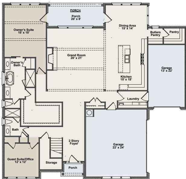
Main Level Floor 2,344 sf