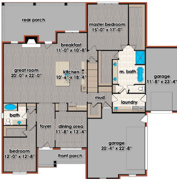
Main Level Floor 2370 sf