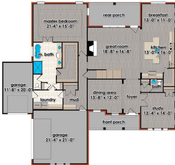
Main Level Floor 2,434 sf