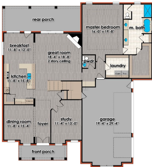
Main Level Floor 2,230 sf