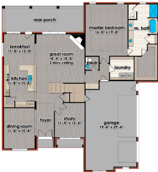
Main Level Floor