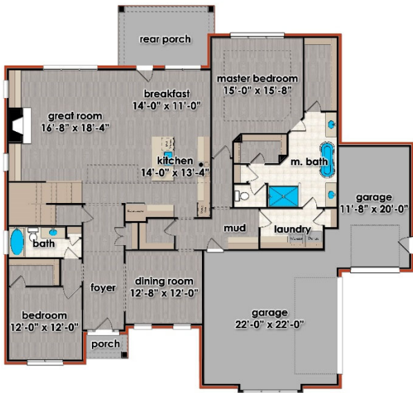
Main Level Floor 2322 sf