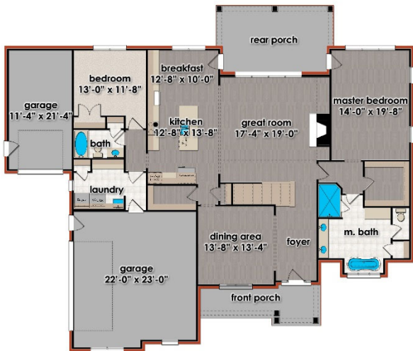
Main Level Floor