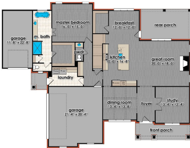
Main Level Floor 2,242 sf