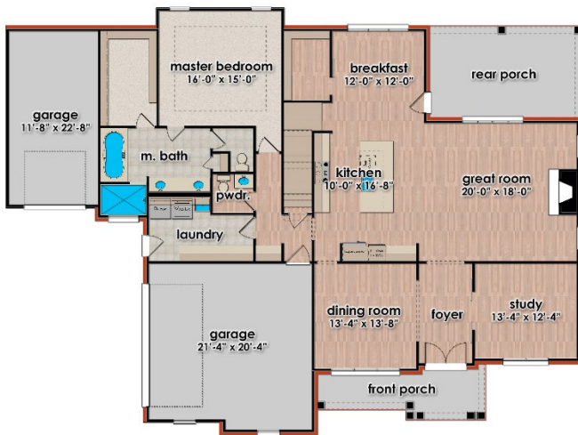
Main Level Floor 2,242 sf