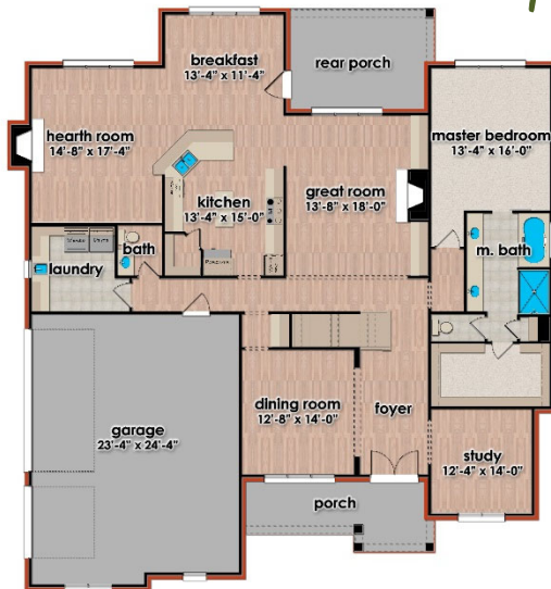
Main Level Floor 2,432 sf