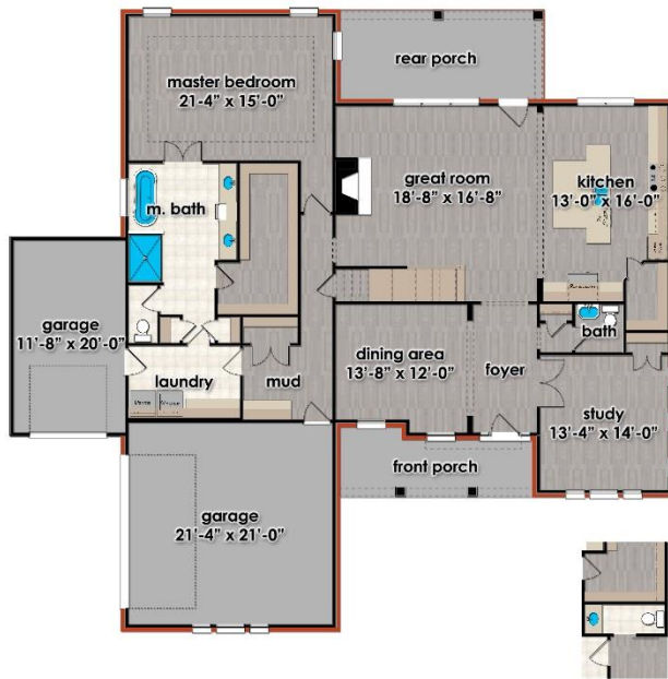
Main Level Floor 2,312 sf