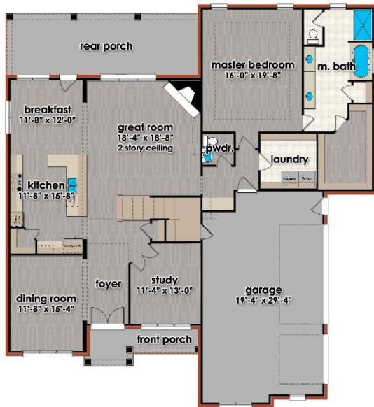
Main Level Floor 2,230 sf