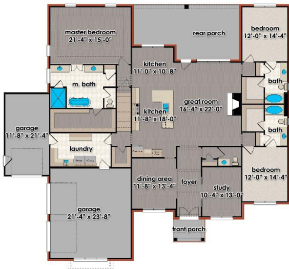
Main Level Floor 2,931 sf