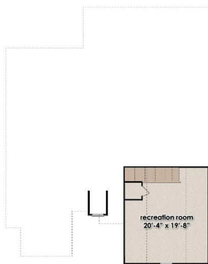
Upper Level Floor 462 sf