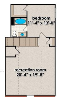
Version C +248 sf

for illustrative purposes only. design and prices are subject to change. reproduction without permission is prohibited.