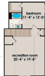
Version C +248 sf

for illustrative purposes only. design and prices are subject to change. reproduction without permission is prohibited.