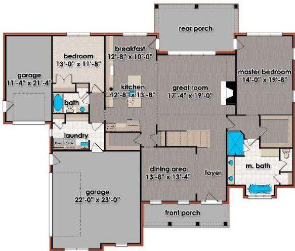
Main Level Floor 2,210 sf