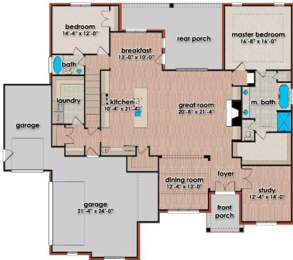
Main Level Floor 2,610 sf